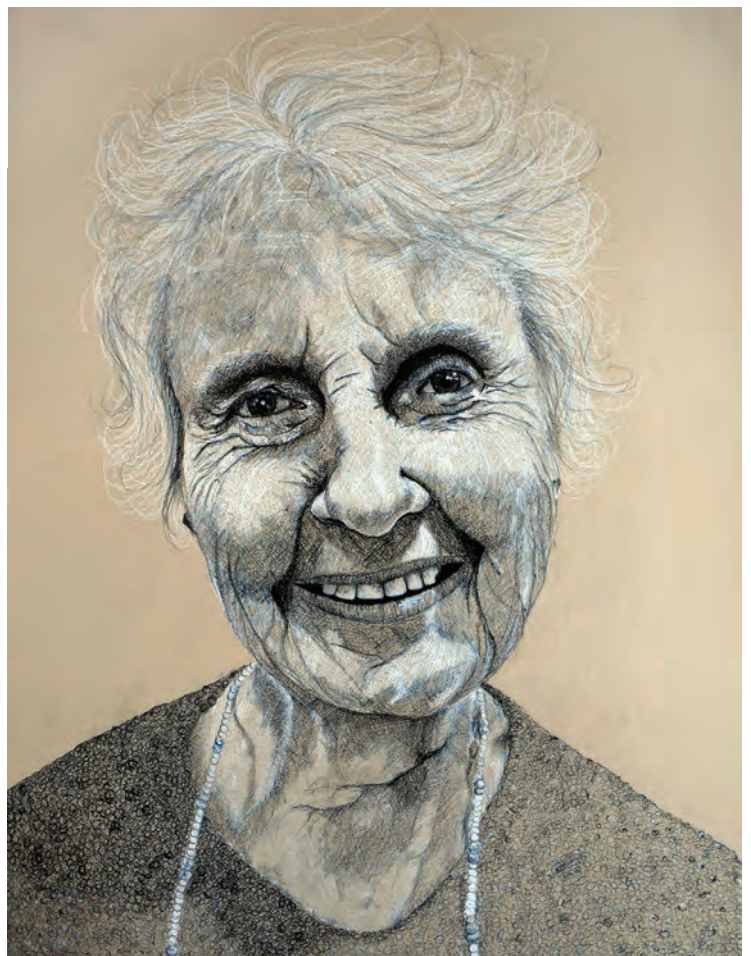
FPS and AIDPSC competitors

In a stand-out performance, Ravenswood's Year 6 IPSHA debaters won every debate at the IPSHA Debating Gala Day held at Abbotsleigh on Monday 29 October. Participating schools included Abbotsleigh, Amity College, Knox Grammar School, Lakes Grammar, Masada College, MLC School, Roseville College, St Luke's Grammar, St Pius X College and Wahroonga Preparatory School.