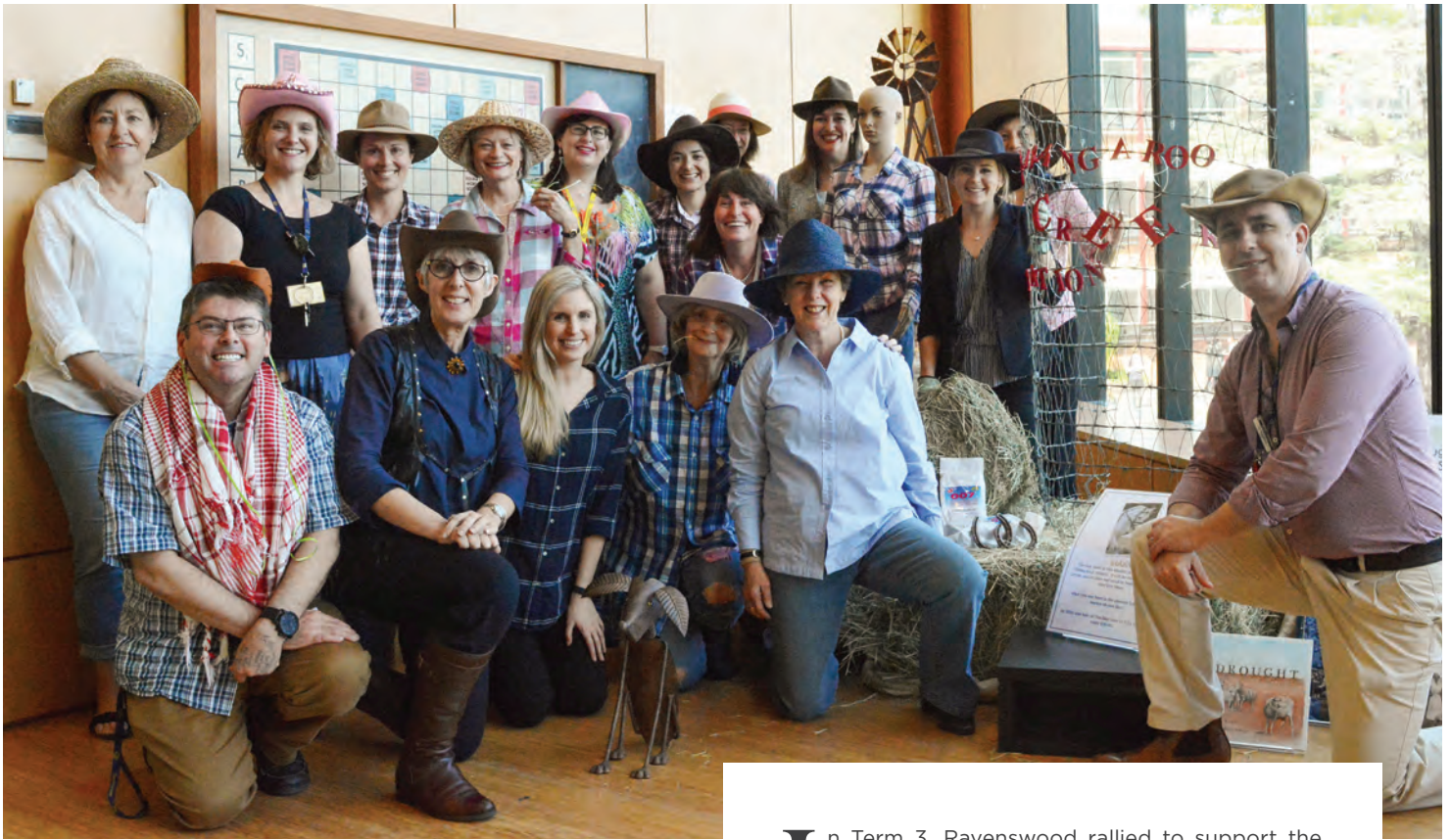
Ravenswood staff supporting Farmers' Day